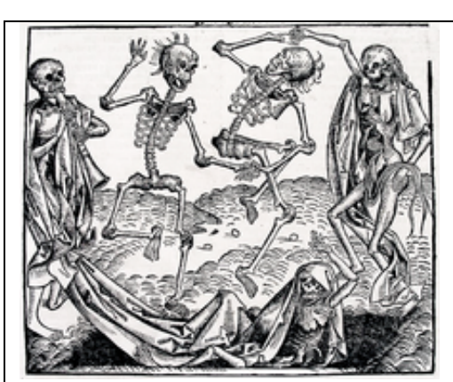
Even art has changed, with images of death replacing images of heaven!

From the looks of it, all of us will be dining with our ancestors very soon. [That supper table is very crowded.]